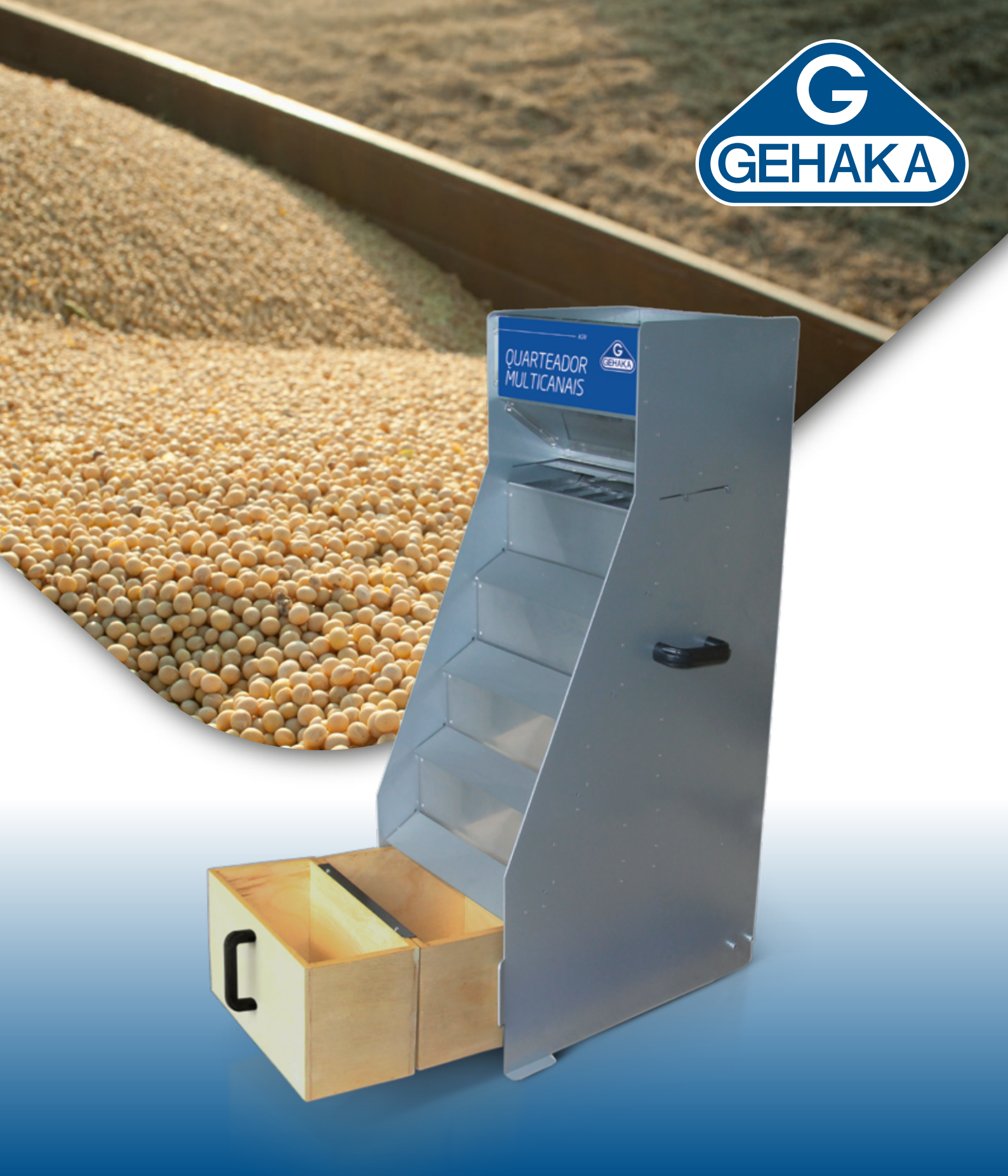
Multichannel Sample Divider Model 16:1